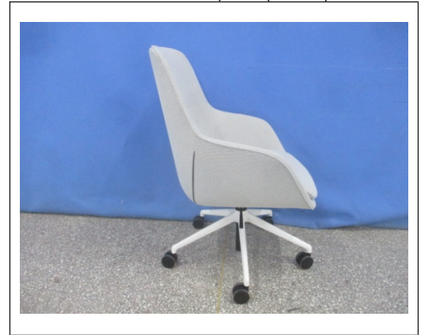
Received sample 1 (view 4)