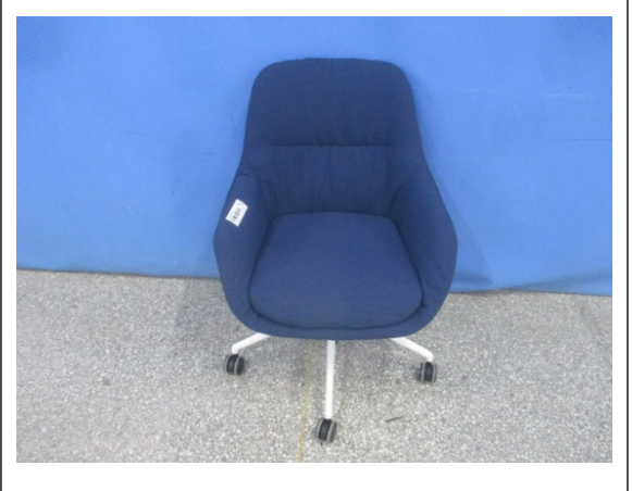
Received sample 2 (view 3)