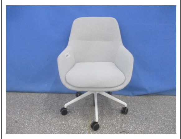
D : 1 1 1 1 ( : 0 )