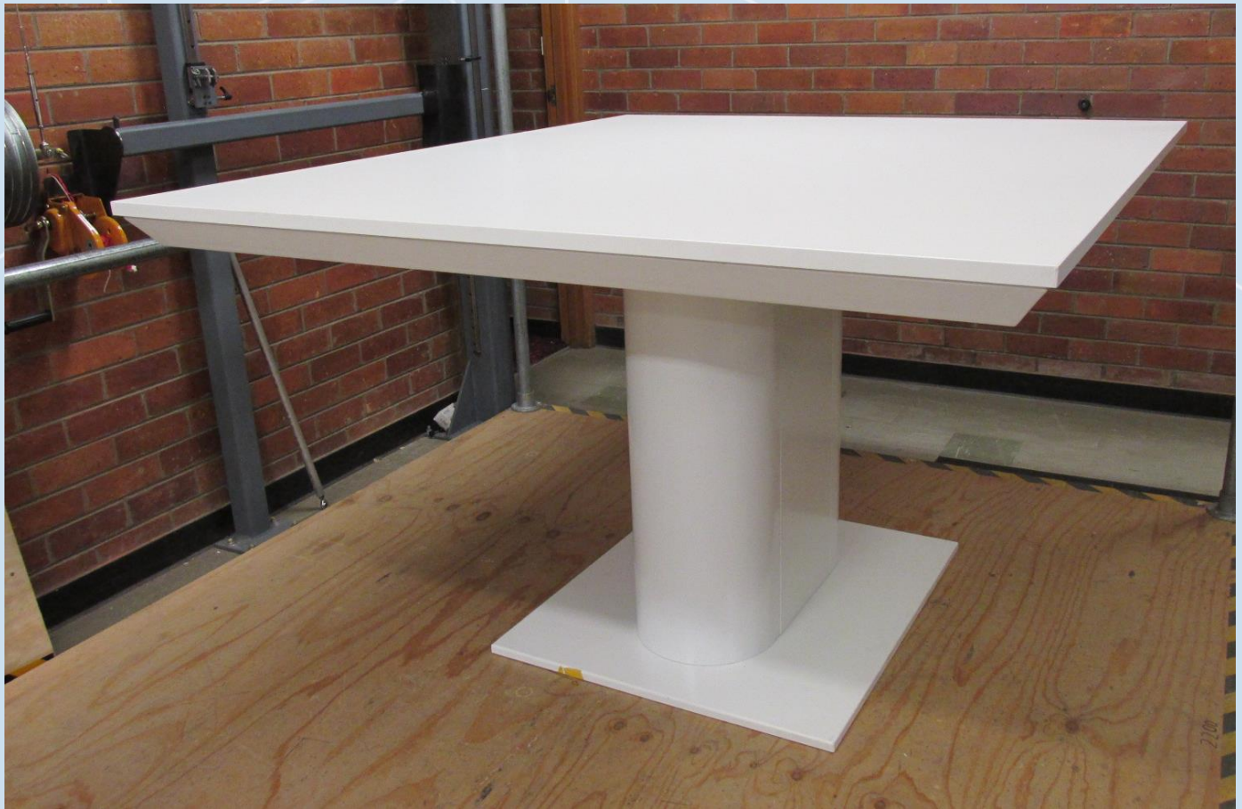
Estate Capsule Table with Floating Base – Fixed Height