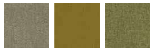
Main Life Flex