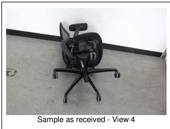
Sample as received - View 4

SGS authenticate the photo on original report only