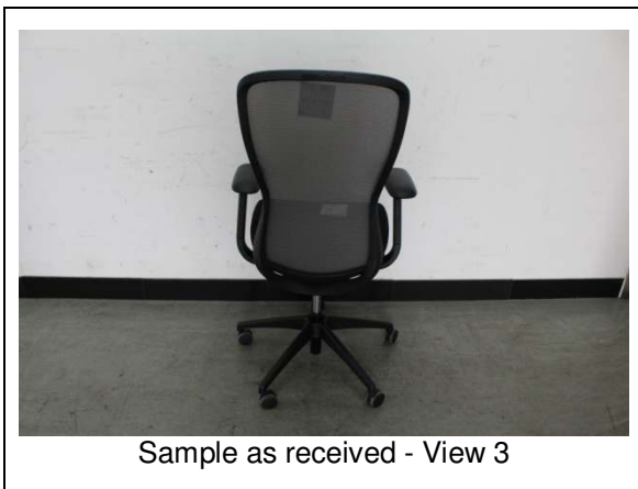
Sample as received - View 3