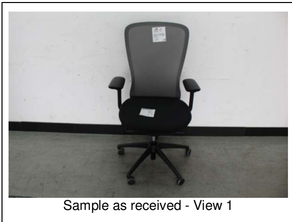
Sample as received - View 1